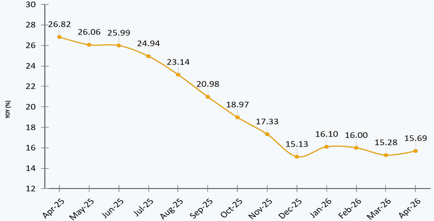
Headline CPI – 12-Month Year-on-Year Trend (%)